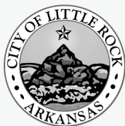
Little Rock, AR