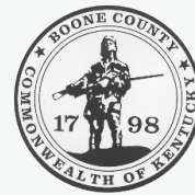
Boone County, KY